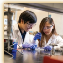
SPECIAL FIELDS OF ENGINEERING & SCIENCE